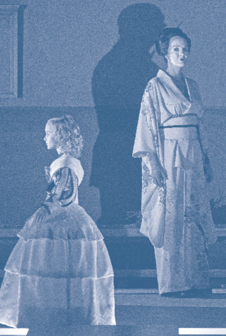
The Makropulos Affair Staatsoper Unter den Linden, Berlin